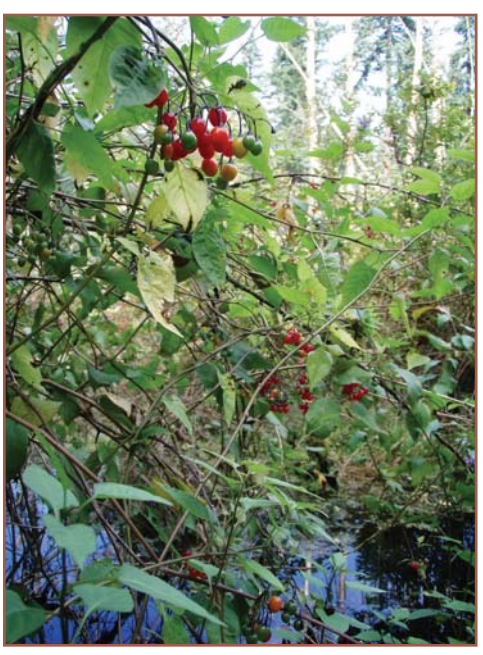
Grows in a wide range of conditions, from dry to wet soils and full sun to moderate shade.