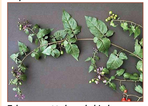
Take care not to leave behind any stem or root fragments, as they can resprout.