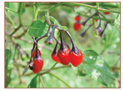
are poisonous. Severe cases can result in paralysis and death.