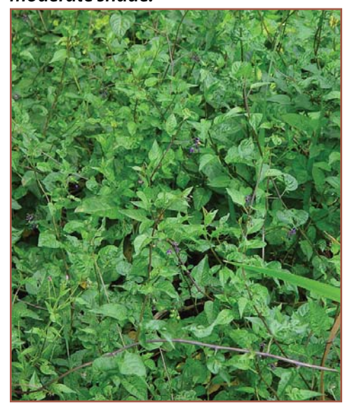
Larger, more mature infestations can be challenging to dig up with a shovel or spade.