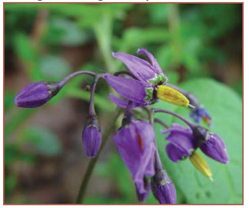
Flowers are purple and star-shaped, with their stamens fused into a yellow cone.